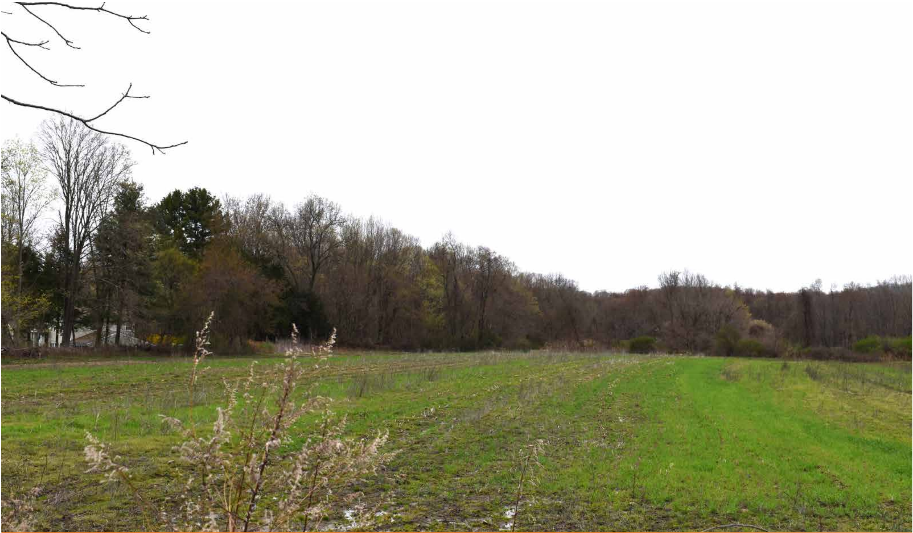
Photo 3 - Granite Springs Road near Hilltop Road EXISTING CONDITION

Date: April 16, 2021 Time: 04:44 PM Focal Length: 48 mm Camera: Nikon D3500