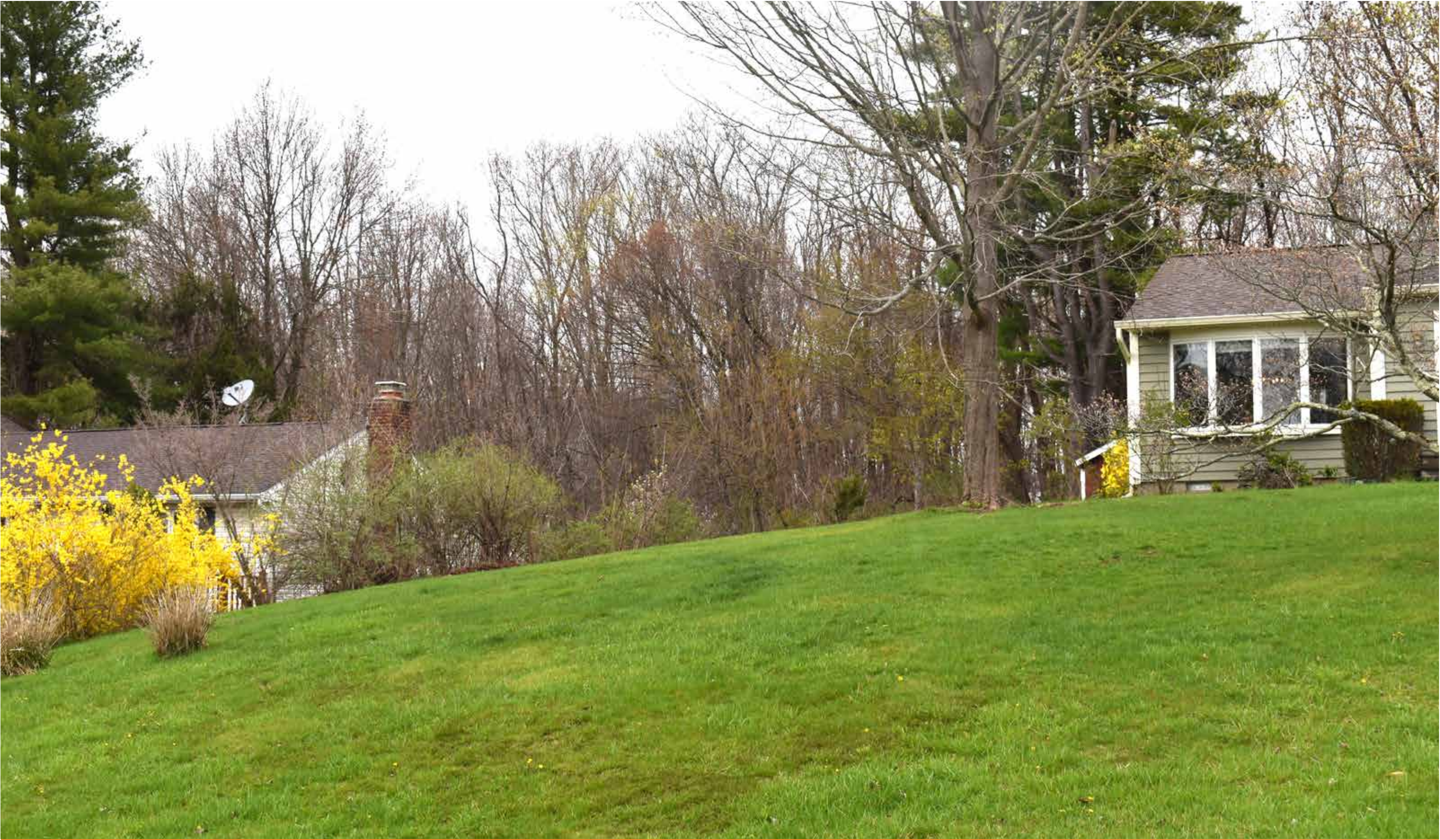
Photo 2 - Granite Springs Road EXISTING CONDITION

Date: April 16, 2021 Time: 04:39 PM Focal Length: 48 mm Camera: Nikon D3500