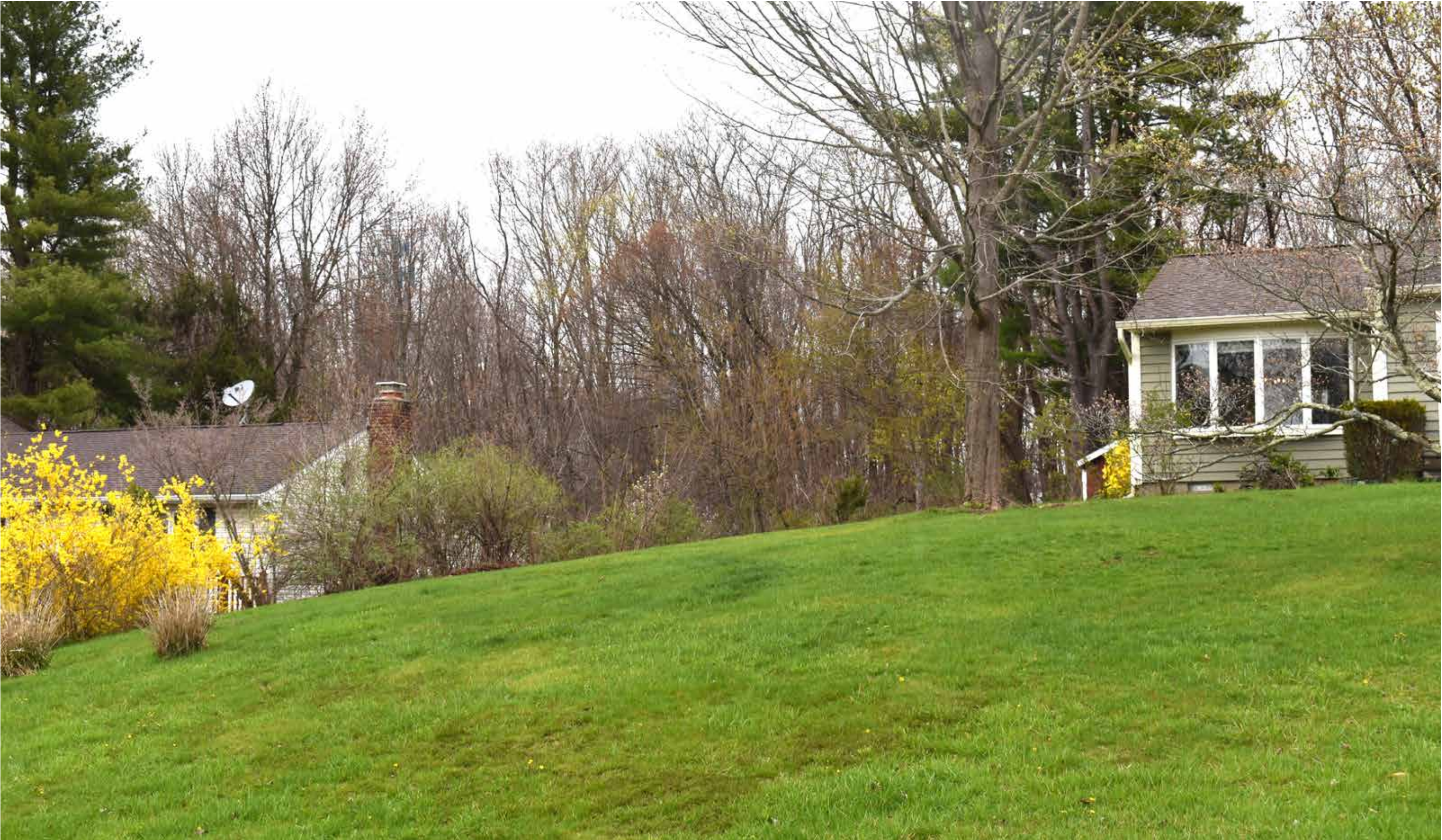
Photo 2 - Granite Springs Road PROPOSED CONDITION - 130FT GALVANIZED TOWER