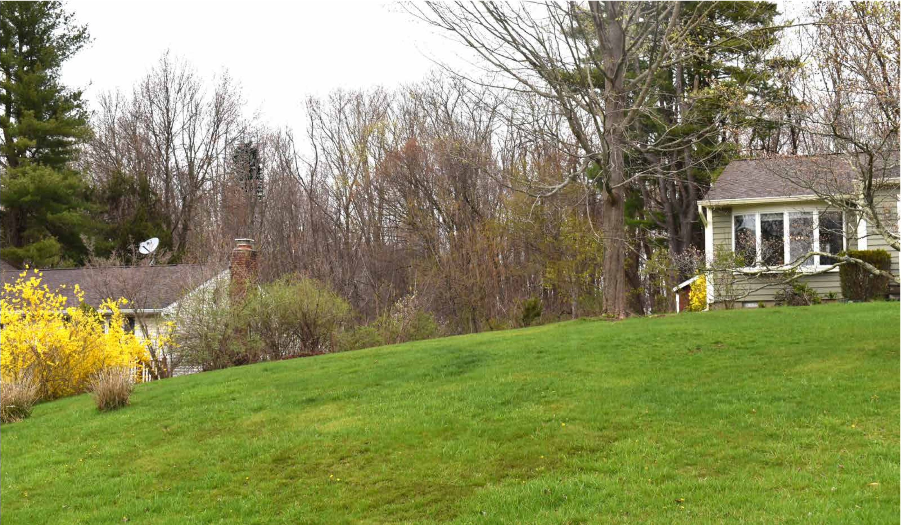
Photo 2 - Granite Springs Road PROPOSED CONDITION - 130FT MONOPINE