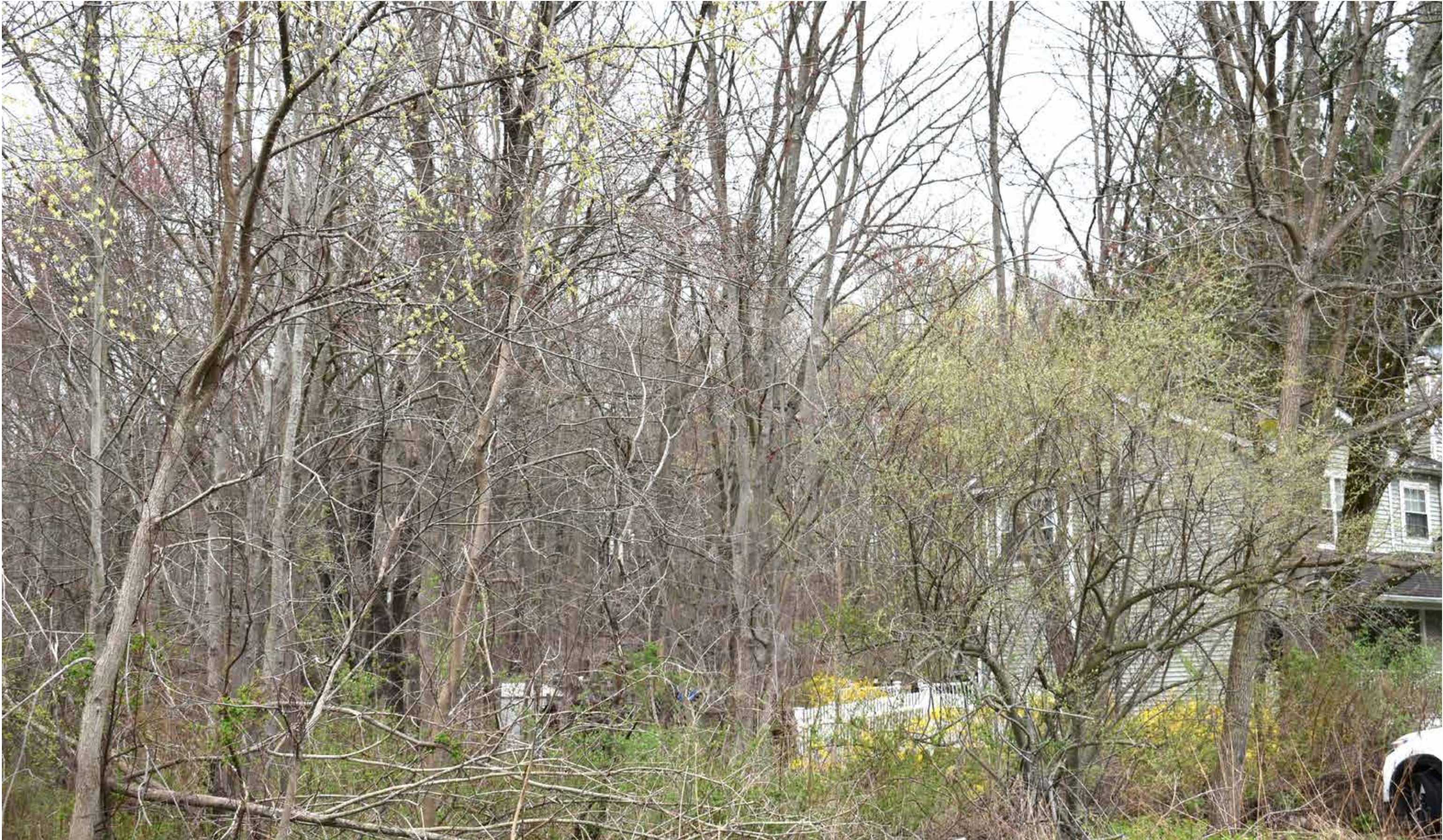
Photo 4 - Granite Springs Road near Hilltop Road, near #54 EXISTING CONDITION