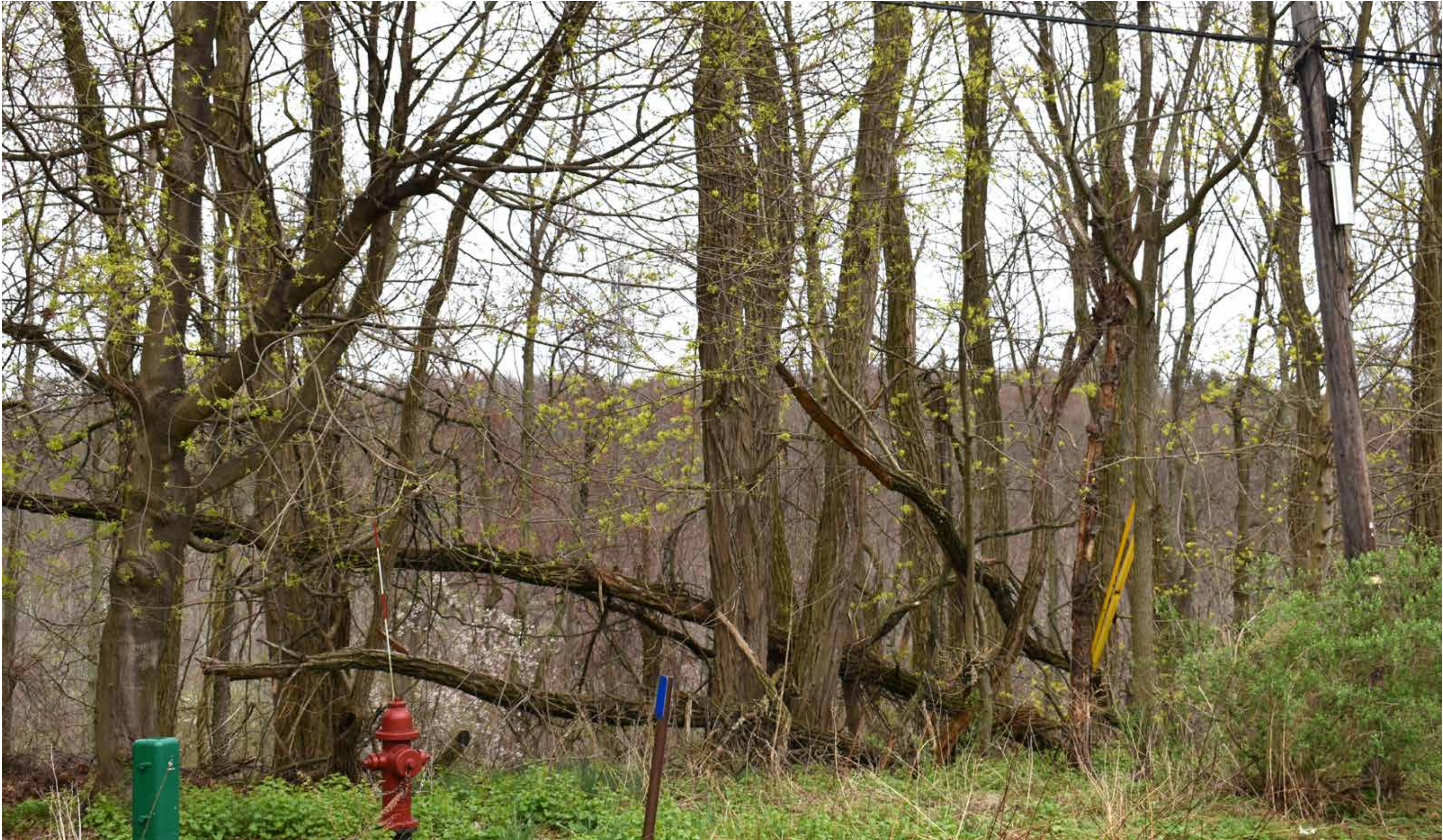
Photo 5 - Weatherby St near Castle Ct PROPOSED CONDITION - 130FT GALVANIZED TOWER

Date: April 16, 2021 Time: 04:54 PM Focal Length: 48 mm Camera: Nikon D3500