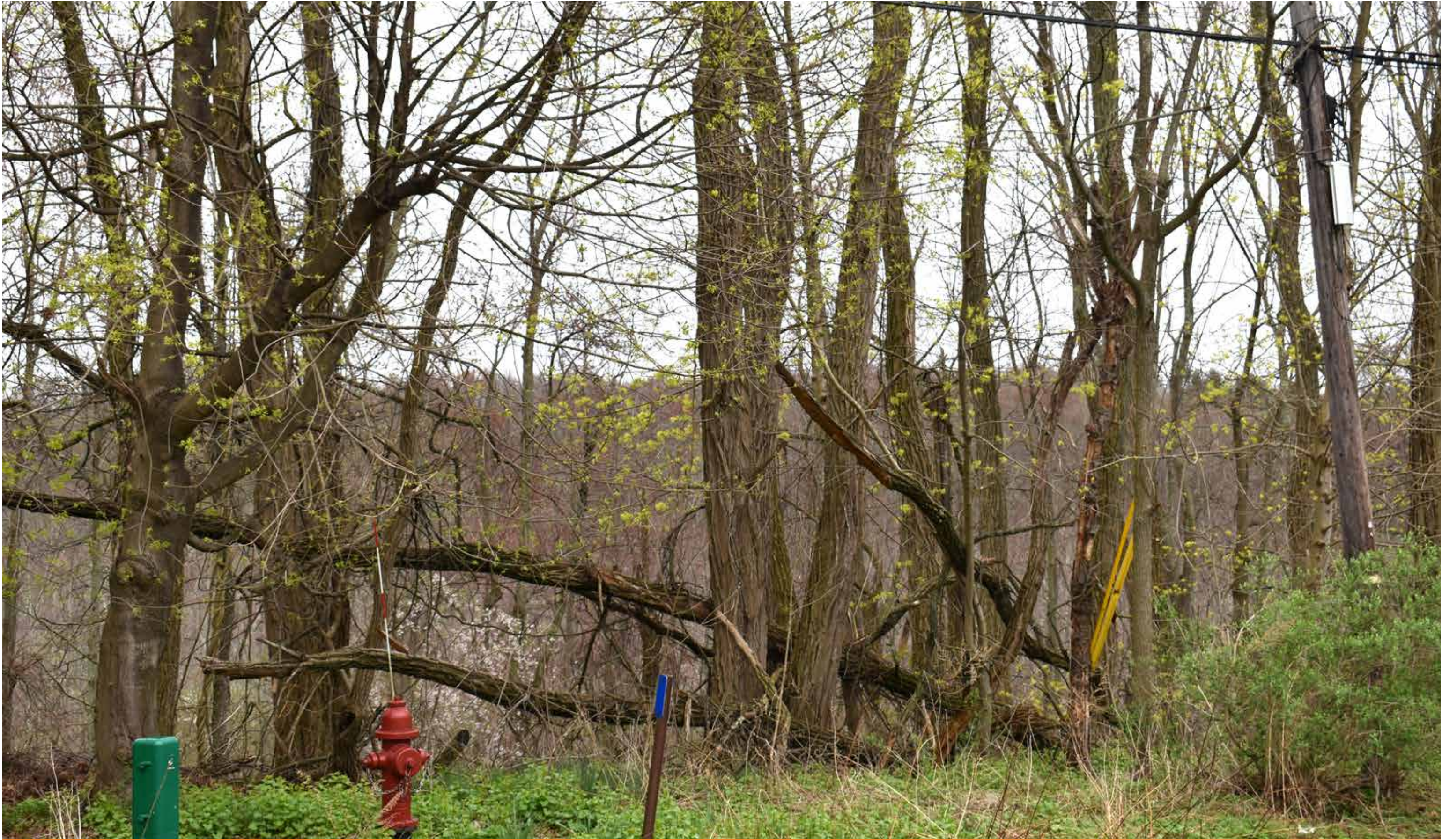
Photo 5 - Weatherby St near Castle Ct EXISTING CONDITION

Date: April 16, 2021 Time: 04:54 PM Focal Length: 48 mm Camera: Nikon D3500