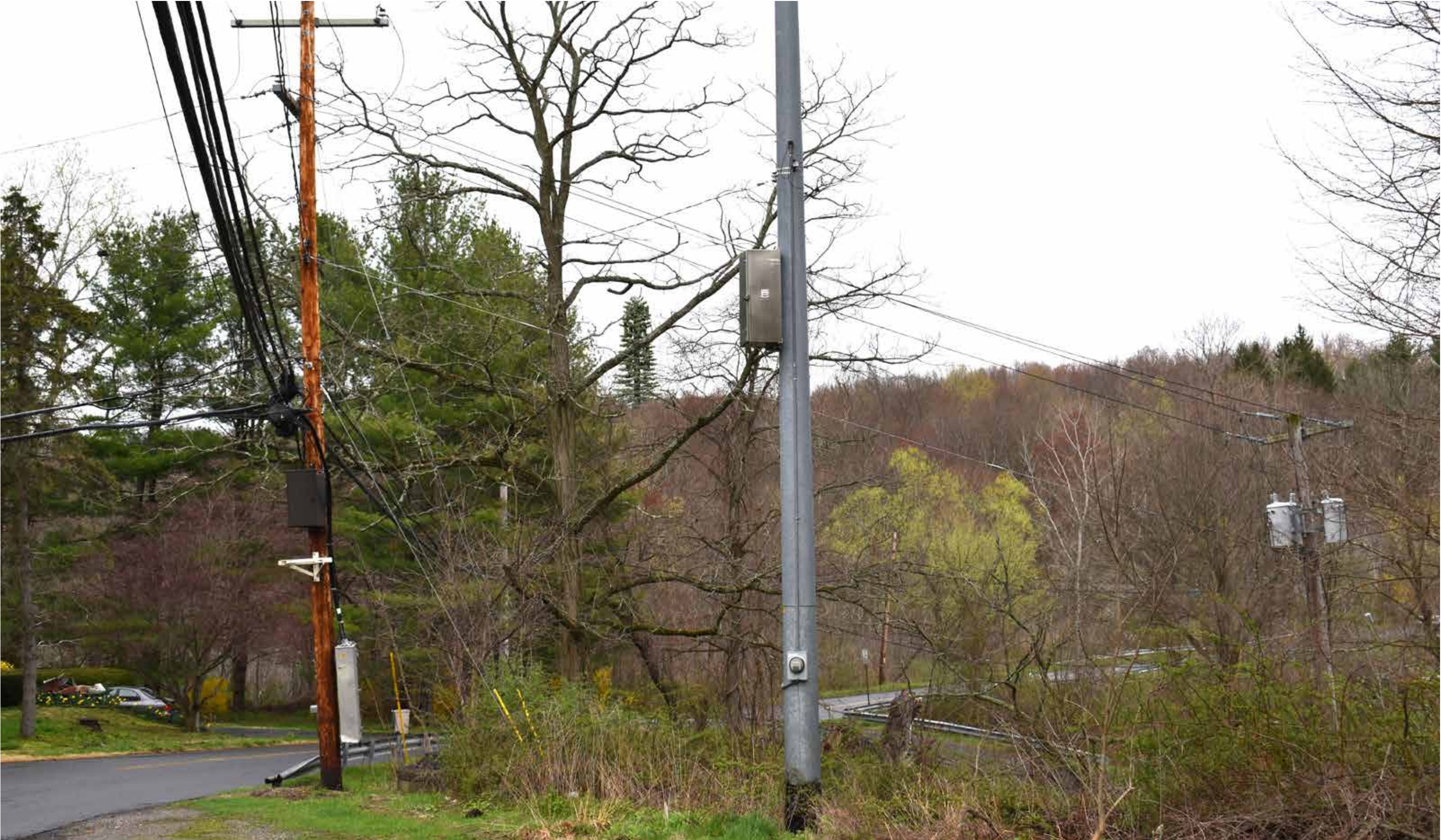
Photo 1 - Granite Springs Road PROPOSED CONDITION - 130FT MONOPINE

Date: April 16, 2021 Time: 04:33 PM Focal Length: 48 mm Camera: Nikon D3500