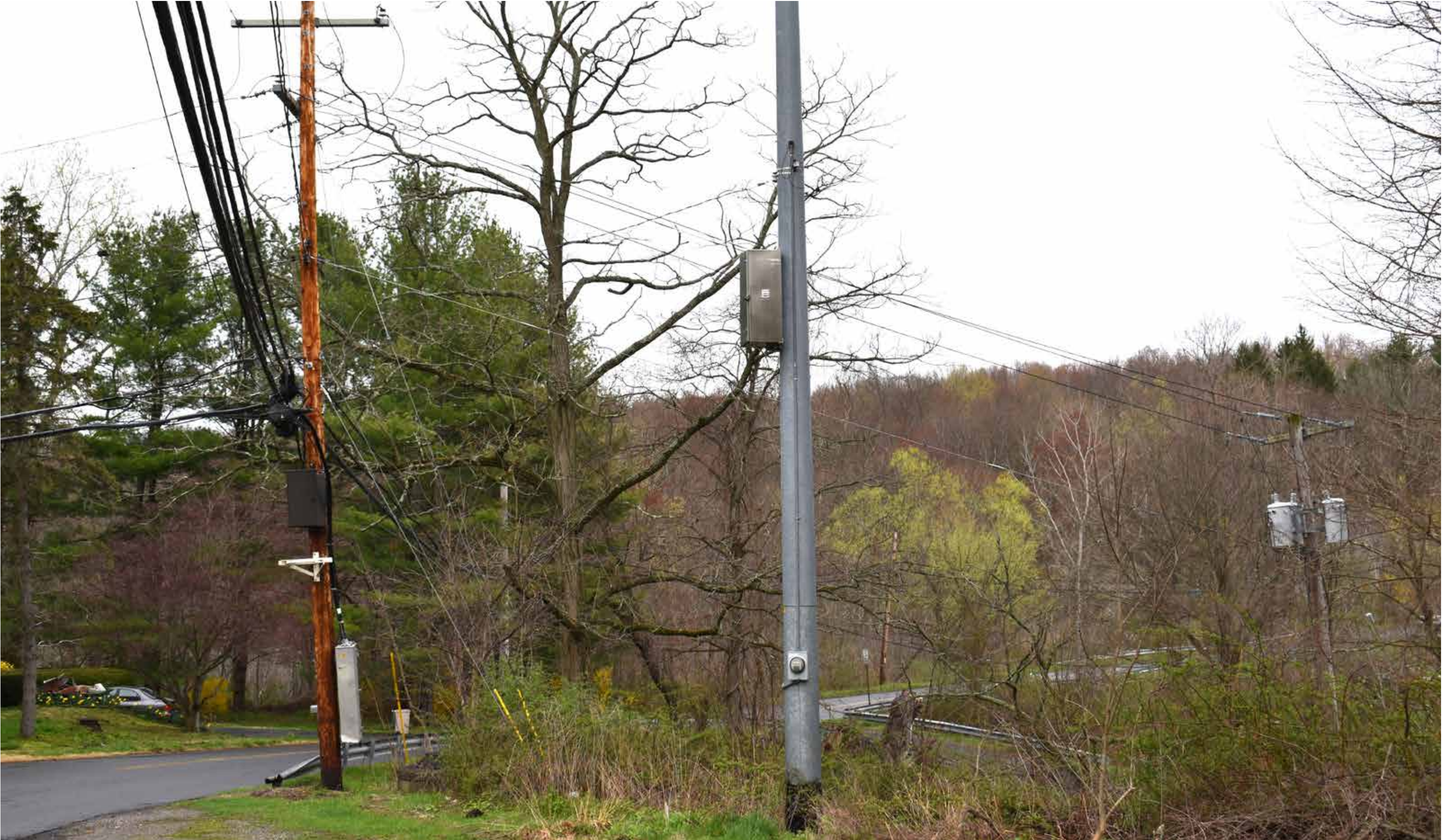
Photo 1 - Granite Springs Road EXISTING CONDITION

Date: April 16, 2021 Time: 04:33 PM Focal Length: 48 mm Camera: Nikon D3500