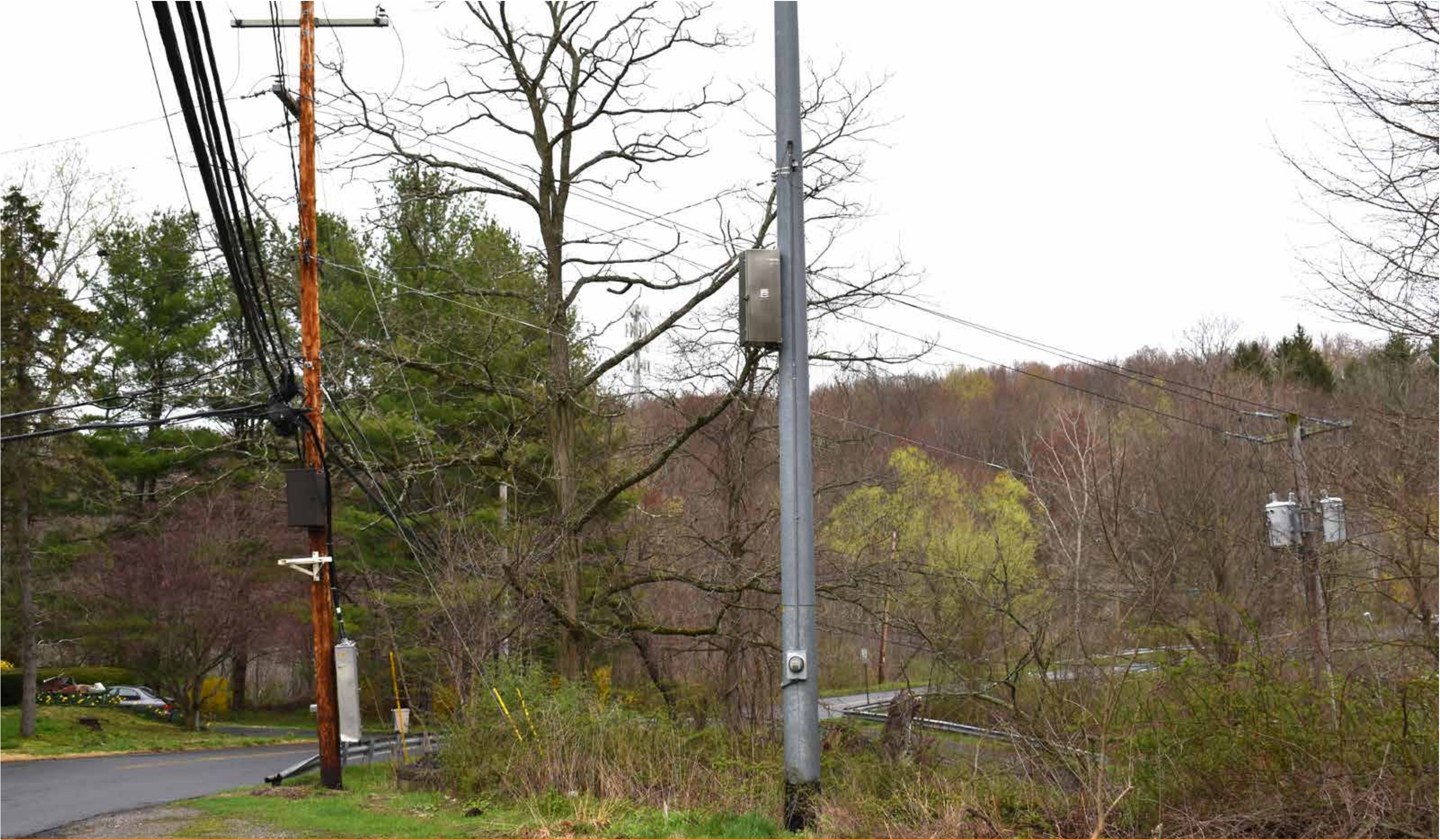
Photo 1 - Granite Springs Road PROPOSED CONDITION - 130FT GALVANIZED TOWER

Date: April 16, 2021 Time: 04:33 PM Focal Length: 48 mm Camera: Nikon D3500