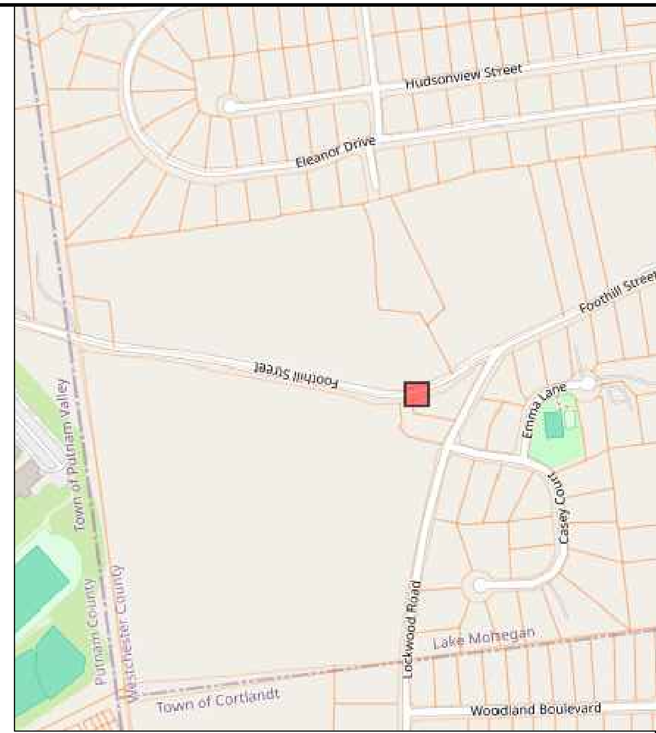
VICINITY MAP SCALE: 1"=400